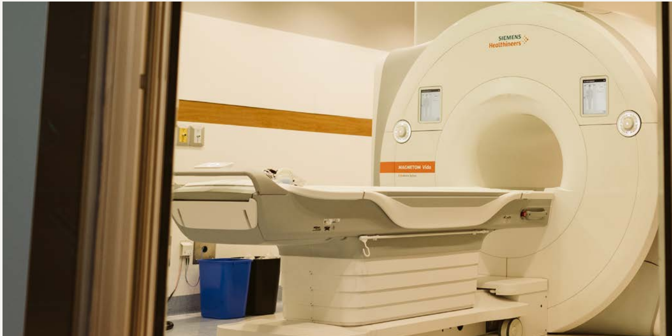
3T MRI AT VGH, BLACKMORE PAVILION, LIVE SINCE FEBRUARY 2023

Your donation has helped Vancouver General Hospital (VGH) invest in innovative tools and equipment which will help improve accuracy in diagnosis and surgical outcomes. These new tools have empowered our clinicians with state-of-the-art technology, so they can provide world-class care for the body's most complex organ.