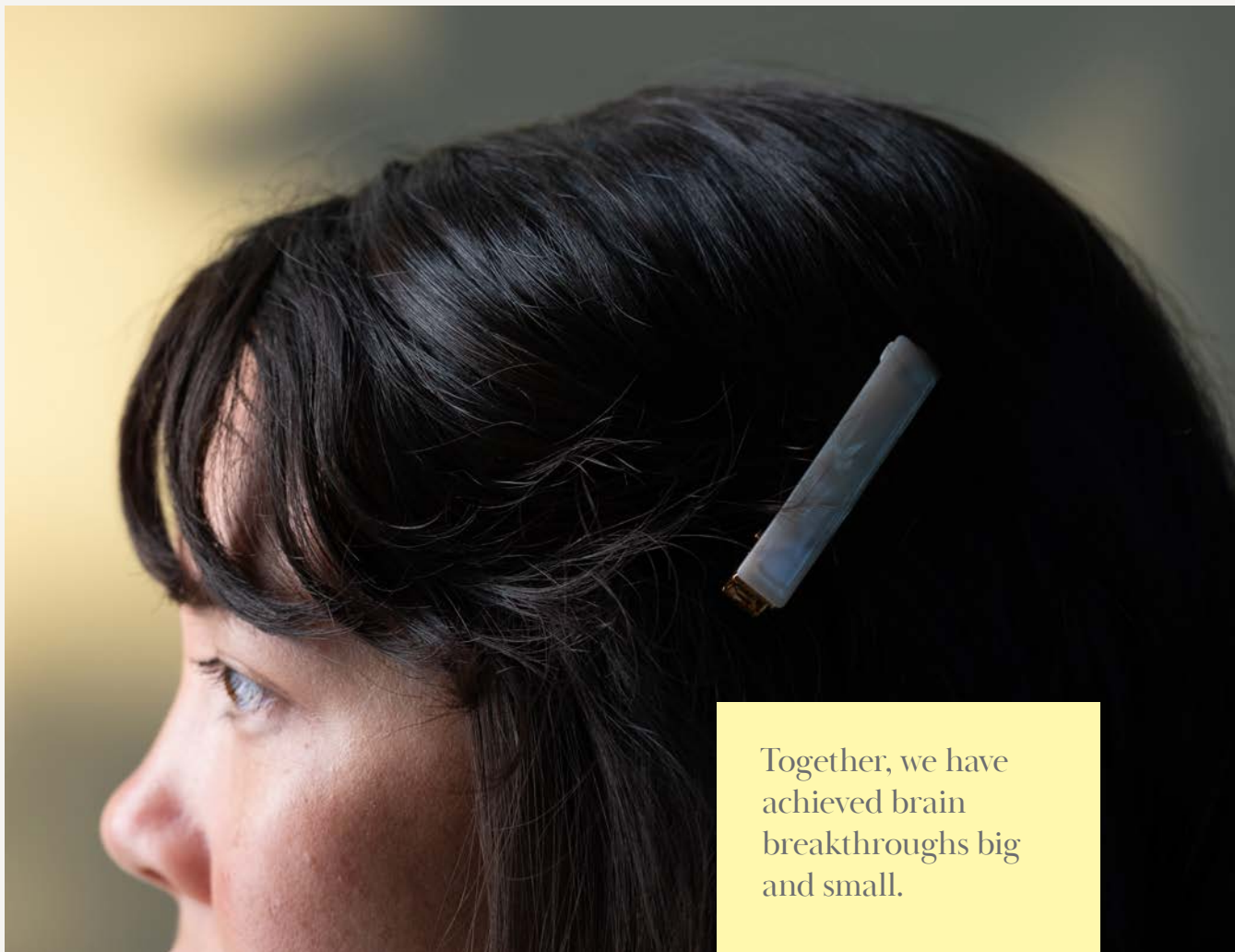
EMILY, BRAIN DISEASE SURVIVOR

Together, we have achieved brain breakthroughs big and small.